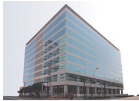
World Headquarters 1-4, Kinko-cho, Kanagawa-ku, Yokohama City, Kanagawa 221-0056, Japan

Company Name: TOKYO ELECTRON DEVICE LIMITED Established: March 3, 1986 Capital: ¥2,495.75 million Employees: 880 (consolidated)